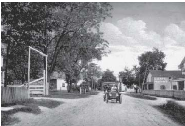
Main Street Sparrowbush, Henry Happ Store on right