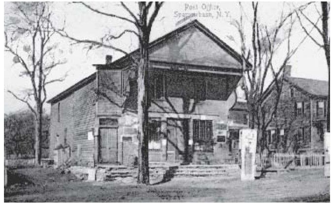
The Tannery Store was built by George Reymar. Starting in 1893, the building housed the post office.

bush has been located in many different buildings since its inception.