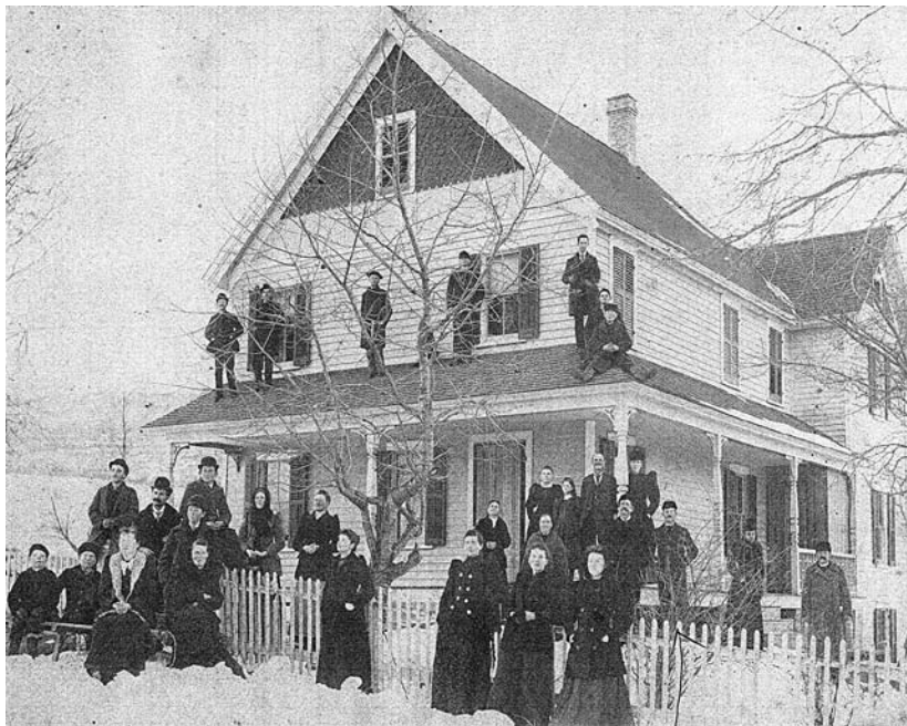
Jackson Family Farm, Prospect Hill Road Three Jackson Girls (center front), Father on the roof November 25, 1890