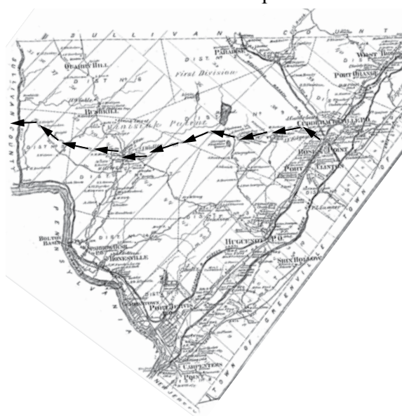
1875 Beers Map

He wanted to live in the country and moved his family to Oakland Valley in the 1930s. During that time he worked as a wall paper hanger and house-painter, but he always wanted to be a chicken farmer.